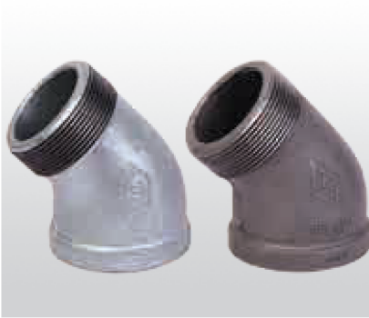
45° Street Elbow